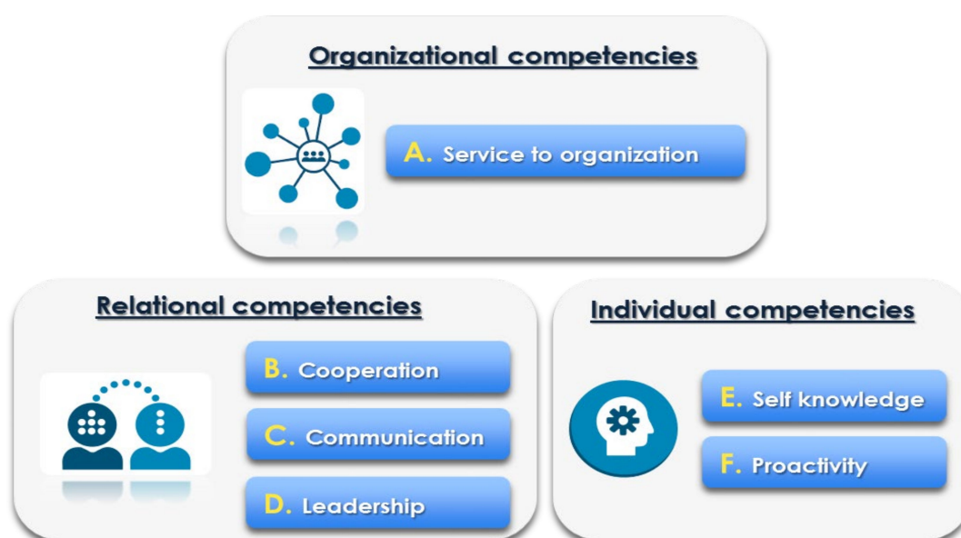
Figure 3. Tools for Enhancing and Assessing the Value of International Experience for Engineers (TA VIE) conclusion which is a framework of global competencies for engineers.

This research allows us to structure the global competencies in three macro clusters (dimensions): organizational, relational and self-knowledge competencies (see Figure 3). Six sublevels were also introduced: service to organization, cooperation, communication, leadership, self-awareness and proactivity. In each group, we identified other competencies.