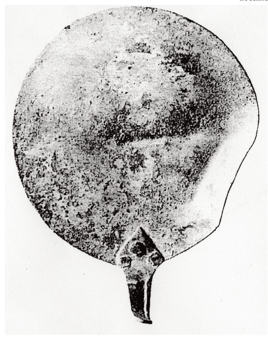
FIGURE 2: Mycenaean mirror from tomb 77, Poggio Selciatello, Tarquinii (after Giovanelli 2017, fig. 2).

have also been found at Veii and Capua in burials dating to the first half of the 8th century BCE.