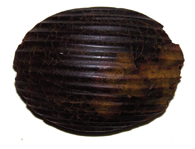
FIGURE 6: Amber ribbed scaraboid from Vetulonia (courtesy of the Civico Museo Archeologico, Grosseto).