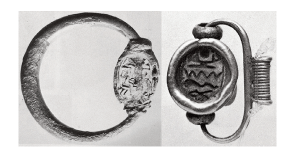
FIGURE 9: Sickle pendant (right, from Pithekoussai) and elliptic pendant (left, from Bisenzio) (after Giovanelli 2016, 453, fig. 1).

Like other Egyptian and Egyptianizing objects, scarabs were considered firstly as amulets, but the ideas and values linked to them are not only of original and direct Egyptian derivation. These concepts were filtered by Semitic people. As an example of this confluence of various ideas, we can mention certain types of mounts in which scarabs could be inserted. They are sickle or elliptic pendants (Fig. 9). These types are of Levantine origin deriving from 2nd millennium BCE pendants documented in Mesopotamia. They resemble the crescent moon and were considered as amulets without any other object inserted in. As noted by De Salvia, they were reasonably associated with scarabs in those areas where contact between different peoples was frequent, such as Al-Mina, Cyprus, the Dodecanese, and Pithekoussai itself. These pendants were probably also produced in Pithekoussai, and in Etruria they seem to have been almost immediately