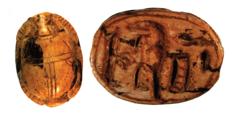
FIGURE 1: Scarab from a Villanovan pozzetto grave (9th/8th century BCE), Tarquinii (after Giovanelli 2015, 108, n. LI.1).