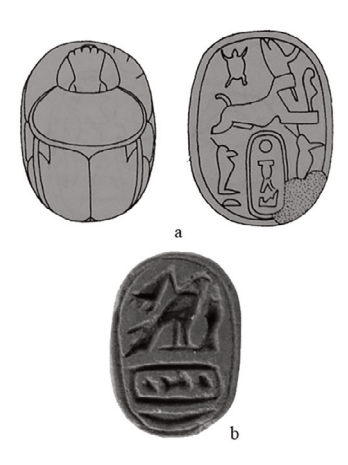
FIGURE 7: Scarabs with the cartouche of the pharaoh Bocchoris. a: from Pithekoussai; b: from Vulci (after Giovanelli 2017, fig. 1).

During the final part of the early Iron Age and at the beginning of the Orientalizing period the number of scarabs considerably increased, and they were still most highly concentrated in the mid-Tyrrhenian area. The discoveries of the last years do not change this trend as it has already been traced by Hölbl.<sup>13</sup> Notably we should mention a new scarab from Vulci, found in a rich tomb dated to the beginning of the 7th century BCE, reporting the cartouche of the pharaoh Bocchoris (Fig. 7). 14 This scarab joins the other one found in Pithekoussai, the famous faience vase from the homonym tomb in Tarquinia and its incomplete twin, now in Palermo. As is widely known, these items set the conventional beginning of the Orientalizing period in the Italian peninsula at the time of the pharaoh. Even though we have no contextual information about the vase preserved in Palermo, the one from Tarquinia belongs to a very rich tomb of a member of the local aristocracy. In this case we cannot exclude the possibility of a gift exchange.<sup>15</sup>