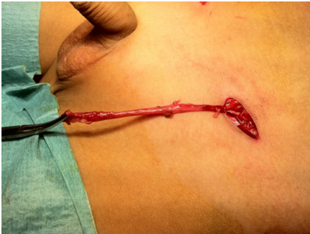
Figure 2 Bilateral inguinal exploration confirms absent testis and atrophic vessels.