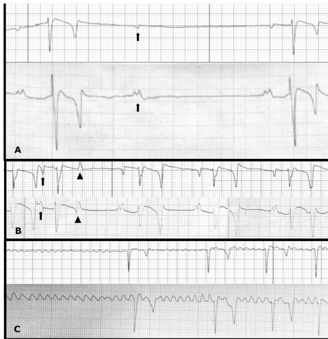
Figure 2 Smartphone ECG (above) and standard ECG (below) tracings recorded simultaneously in horses of both groups. Heart rate and rhythm are the same on both tracings of each panel where the ECG pairs have been lined up to match exact time points. (a) Second-degree atrioventricular block. Notice the single P wave (arrow), not followed by a QRS and T wave. Moreover, a different appearance of the P waves is visible on the standard ECG tracing. (b) Supraventricular premature complex. Notice the premature P wave (arrow) followed by a QRS complex of normal morphology and a T wave of opposite polarity to the QRS complex (arrowhead). (c) Atrial fibrillation. Notice the absence of P waves and the presence of f waves, associated with irregularity of the RR intervals.

On stECG, the P wave was positive in 17 cases (89.5 per cent) and biphasic in one case. On sECG, the P wave was biphasic in 18 cases (94.7 per cent). In one case, the P wave was absent due to the presence of atrial fibrillation. On both ECGs, the QRS complex was negative in all cases. The ECG measurements are reported in table 1 .