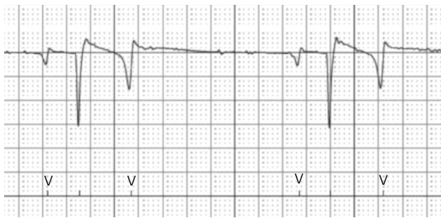
Figure 3 A smartphone ECG tracing in which the P and T waves were recognised as R waves by the autodetection algorithm. Arrowheads indicate the wrong marks.

and QRS complex. Similar results are described in dogs, 7 whereas, to the authors' knowledge, no previous studies have been carried out on the evaluation of wave amplitude in horses. The differences in amplitude between sECG and stECG could be due to the different placement of the electrodes. In fact, the proximity of the two electrodes of the smartphone device creates a small dipole compared with stECG and this can result in a lower voltage of ECG waves and in a variation in polarity of P wave. A similar hypothesis has been suggested by Kraus and colleagues, who however did not compare P and QRS amplitudes in their study. 13