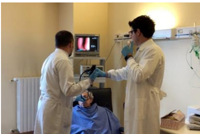
Fig1: Picture showing the position of the patient and of the two surgeons during the office-based laryngeal biopsy (OBLB). The patient is in a semi-seated position, the first surgeon maneuvers the endoscope, while the other one maneuvers the biopsy forceps.

The procedure was performed under local anesthesia on an outpatient basis after formal written consent was obtained. All the procedures were performed by two surgeons: one maneuvered the endoscope and the other one maneuvered the biopsy forceps (Fig.1).