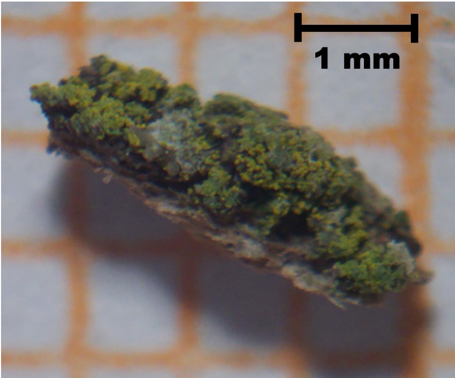
Fig. 2. Top: bark fragment collected at autopsy on the inner surface of the left forearm of the victim in the investigated case. Bottom: magnified view of the bark fragment.