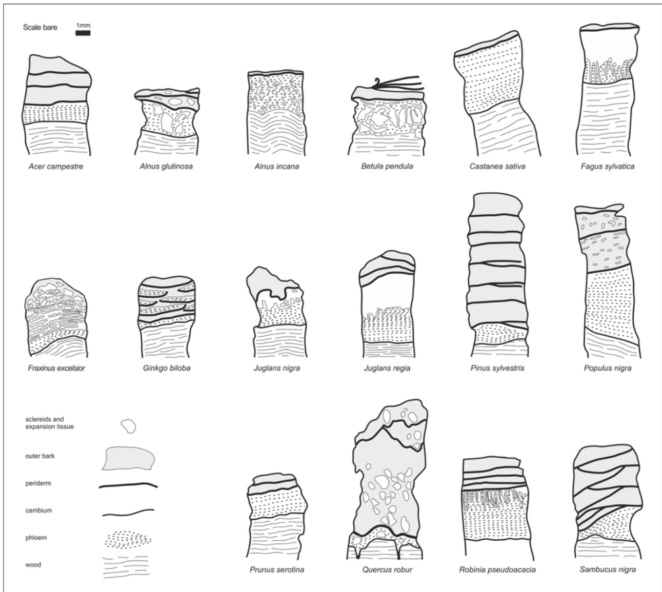
Fig. 3. Scheme of the different bark structure observed in the investigated species

The sampled species showed very variable bark structures (Fig. 3). The main features differentiating the samples were the occurrence and number of periderms, their appearance (i.e., color, thickness, disposition, occurrence of dead secondary phloem and of its fibers), the morphology of the secondary phloem in the inner bark (color, occurrence of growth rings, of fibers), the occurrence and distribution of expansion tissue, the arrangement of fibers and of expansion tissue elements in sclereids, the occurrence of specific traits (rays, resin ducts). A certain degree of variability could be observed within a species or an individual, particularly in terms of thickness and appearance of the outer bark. The first identification key (table 1) allowed the discrimination of all the collected species; only Juglans nigra and J. regia , although visually different, could not be distinguished on the basis of unambiguous traits.