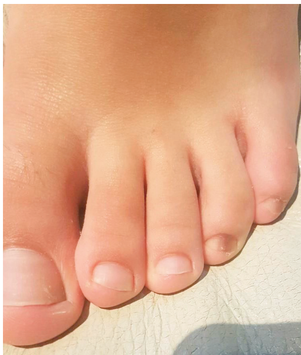
Figure 3. Partial regression of pigmentation after one-year follow-up

Longitudinal melanonychia, also known as melanonychia striata, is clinically manifested as a longitudinal streak of tan, brown or black pigmentation extending from the nail matrix along to the tip of the nail plate (1, 2). Depending on the number of nails involved, it can be presented in a form of single or multiple longitudinal melanonychia (1, 2).