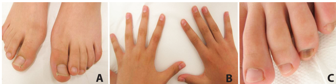
Figure 1. Pigmentation on the fourth right toenail and the fourth and the fifth left toenail without affecting the fingernails (A, B, C)

when pigmentation involves the whole nail plate, or transverse or longitudinal melanonychia, when pigmentation involves the nail in a form of transverse or longitudinal band of pigmentation, respectively (1, 2). The vast majority of melanonychia belongs to longitudinal melanonychia, while other two forms are reported occasionally (1-3).