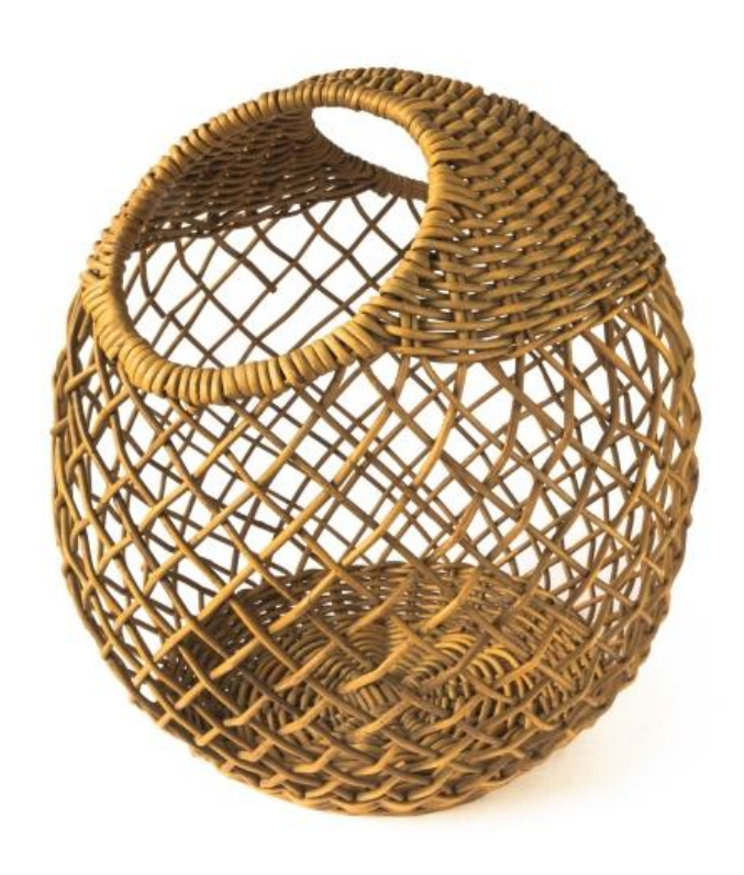
Fig.4. R. Sambonet, Mappin fashion department store advertising, São Paulo, 1952. Courtesy of Archivio Roberto Sambonet. Fig.5. R. Sambonet, Basket, bag designed by Sambonet for La Rinascente department stores, 1951, wicker, produced by Vittorio Bonacina. Courtesy of Archivio Roberto Sambonet

The poster for the Mappin department stores [fig. 4] designed by Sambonet<sup>24</sup> and the basket produced for La Rinascente<sup>25</sup> in 1956 [fig. 5] illustrate, therefore, this prototype of reverse hybridisation and superficial cross-contamination between European sensibility and elaborations upon local products. In one case the outline of the mannequin in the style of the fashion magazine Vogue has a bamboo tree in the background, anticipating Sambonet's studies of Brazilian flora, which became the book entitled 22 cause + 1<sup>26</sup>, while the basket reveals the study of forms and materials of popular Brazilian artefacts collected during his travels inland and on the coast<sup>27</sup>.