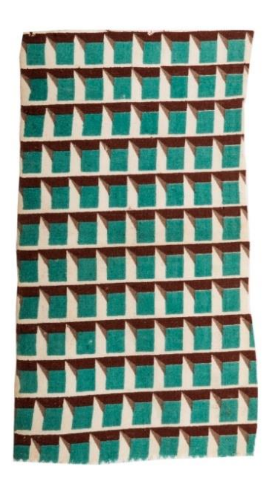
Fig.3. R. Sambonet, Fabric with grid pattern, 1952, printed cotton, produced by Mappin Stores, São Paulo.

Yet it is often the drawings for fabrics which reveal an unequivocal ascendency of the native models. The fabric motif <sup>22</sup> reproduced [fig. 3] here can be traced to the well-known prototype of the brise soleil of the Ministério de Educação e Saúde in Rio de Janeiro.