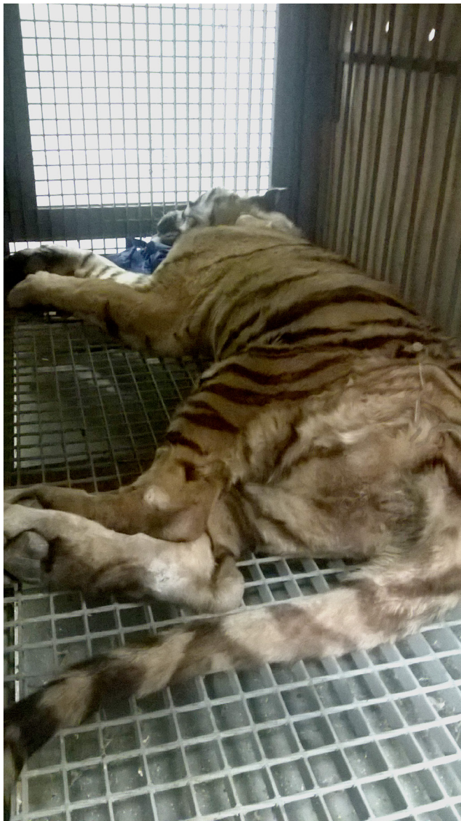
Figure 2 Attainment of lateral recumbency in one tiger.

procedures, the original immobilisation protocol was varied as follows: (A) Tigers scheduled for diagnostic procedures requiring general anaesthesia were additionally administered with intravenous titrate-to-effect propofol (Propofur; Boehringer Ingelheim Animal Health, Italy) to achieve orotracheal intubation and maintained with isoflurane (Isoflo; Zoetis, Italy) in 100 per cent oxygen. These animals were also administered with an intramuscular injection of butorphanol (Dolorex; MSD Animal Health, Italy) at 0.1 mg/kg on intubation. (B) Tigers showing no signs of sedation after 15 minutes post darting (ie, permanence of standing position and full responsiveness to environmental stimuli) were readministered with 10 µg/kg of DEX and 2 mg/kg of KET by remote intramuscular injection. (C) Tigers attaining lateral recumbency but showing ear twitch reflex were administered with intravenous titrate-to-effect propofol in order to abolish the reflex and ensure deeper sedation.