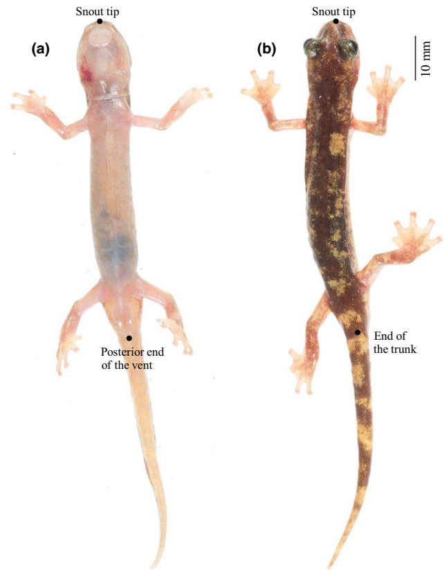
FIGURE 1 Hydromantes flavus (individual 1074777; Lunghi et al., 2020). (a) Ventral view, the points to measure SVL are marked. (b) Dorsal view, the points to measure SVL e are marked

The European Hydromantes are comprised of eight threatened species distributed in Italy and France (Lanza et al., 2006). These salamanders are strictly protected by national and international laws (European Community, 1992; Rondinini, Battistoni, Peronace, & Teofili, 2013) because multiple threats, such as habitat degradation, climate change, spread of pathogens, and poaching, are negatively impacting their populations (Lunghi, Corti, Manenti, & Ficetola, 2019; Mammola et al., 2019; Martel et al., 2014); therefore, specific authorizations are needed to conduct studies on these