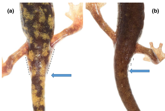
FIGURE 2 Diagnostic characters indicating where the trunk of Hydromantes ends. (a) The conical end of the salamander's body indicates the base of the tail; a natural “line” helps in identifying this point ( H. flavus , individual 1074390). (b) In some cases, a few folds are visible behind the hind limbs; the posterior end of the cloaca roughly corresponds to the third fold ( H. genei , individual 1033580)

We used linear mixed models (LMMs) (function lme of the R package nlme; Pinheiro, Bates, DebRoy, Sarkar, & Team, 2016; R Development Core Team, 2019) to evaluate the relationship between SVL and SVL_e in European Hydromantes . The salamanders' SVL_e was used as the dependent variable and the SVL as the independent variable. The experience of operators (yes/no), together with the identity of operators, salamanders, and species, were assigned as random factors. The correlation coefficient between SVL_e and SVL was calculated with the function r.squaredGLMM of the R package MuMIn (Bartoń, 2016). We calculated the mean squared error (MSE) between SVL and SVL_e and assessed whether it significantly differed from zero. We used LMM to evaluate the relationship between the MSE (dependent factor) and SVL (independent factor); considering that the operator experience may affect measurement equality