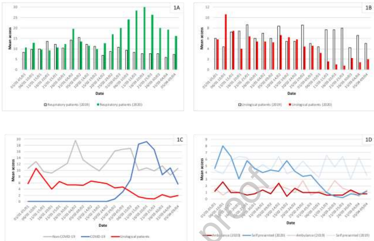
Figure 1. Average admissions to emergency department with respiratory (1A) and urological diagnosis (1B) in 2019 and 2020.

Mean access of respiratory patients (divided on the basis of COVID-19 diagnosis) and urological patients in 2020 (1C).