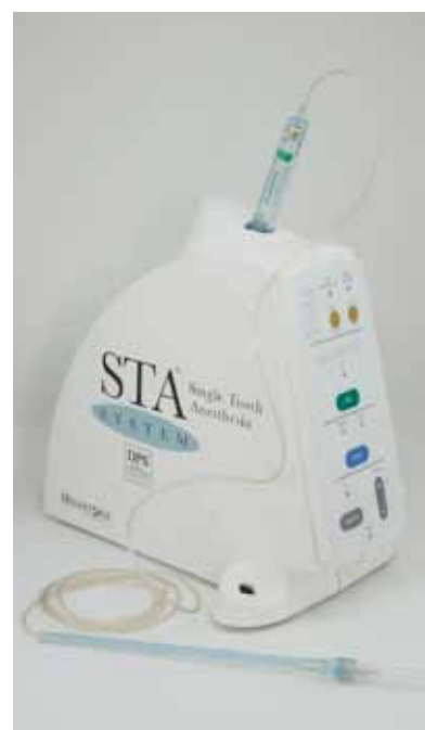
FIG. 2 The delivery system used.