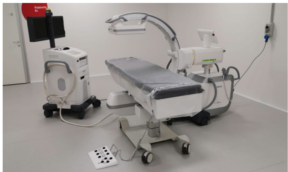
Fig. 6 Portable C-arm

For hybrid procedures, US machines may be taken from one of the modules, but must undergo strict decontamination SOP in between patients, despite the red zone location.