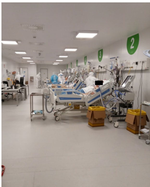
Fig. 2 Example of beds in each module

and complete compliance. Non-powdered latex-free gloves should be used by all operators. Eye protection and face shielding should be used. Gowns should be long-sleeved and made of non-absorbable (fluid-resistant) materials. The same gown should not be worn for all patients. In case gowns are not available, waterproof aprons should be used.