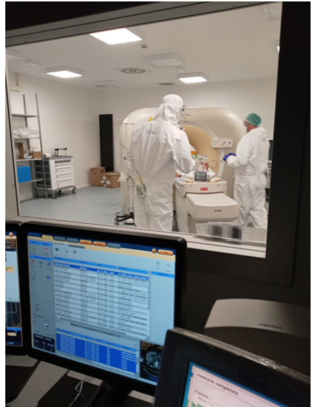
Fig. 4 CT scan

Once the decision is made that a CT scan is clinically indicated, after donning PPE, a radiologist and