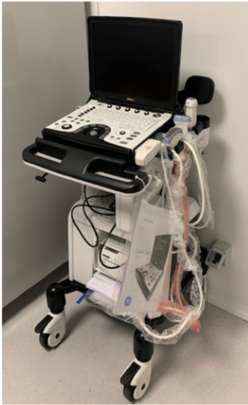
Fig. 3 US machine

arises. Recently, lung ultrasound has rapidly become a tool for monitoring of patients stricken by the novel COVID-19, helping in clinical decision making and reducing the use of both chest x-rays and computed tomography (CT) [5]. US may provide a rapid, continuous, and real-time assessment of peripheral lung physiology, such as fluid in peripheral infiltrates, interlobular septal thickening, or any adjacent effusions, which may change dynamically.