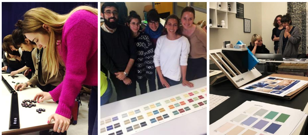
FIGURE 1 PICTURES TAKEN DURING THE FUNDAMENTAL AND THE PROJECT WORKS.

In general, we found that, the union of empowerments with color theory modules are very useful to support the students' process of personal growth by developing the ability of form relationships and work successfully in a variety of fields.