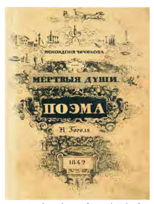
2. N.V. Gogol', Book cover for Dead Souls (1842)