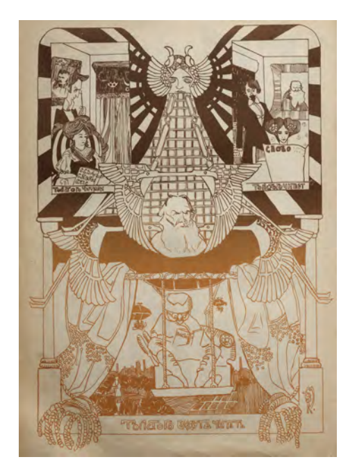
"Tolstoi was read; Tolstoi is read; Tolstoi will be read" (Budil'nik, 24 August 1908, n. 33)