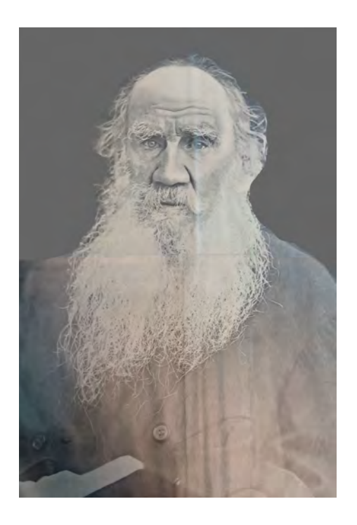
Portrait of Tolstoi (Supplement to Russkoe slovo, 28 August 1908)

Attached to Russkoe slovo was also the weekly illustrated magazine Iskry ( Sparks , price 3 roubles / year, or with Russkoe slovo for a total of 9), which greeted Tolstoi's jubilee by dedicating articles to him in three different issues between August and September. On the cover of the 24 August issue, the image of Tolstoi, absorbed and intent on reading, is enclosed in a frame that rests on four books: War and Peace, Childhood and Boyhood, Resurrection, Anna Karenina . Inside the supplement, the narrative function was entrusted exclusively to the images, which attempt to offer a comprehensive portrait of Tolstoi through the frame of his manuscripts, a montage of works of art that represent him, and a series of sequences taken from his daily life at Iasnaia Poliana.<sup>73</sup> In the 7 September issue, Iskry offered its readers a more intimate and domestic reading of what happened on 28 August, publishing under the title "On 28 August at Iasnaia Poliana" ("28-avgusta v Iasnoi Poliane") a dossier of photographs of Tolstoi in pain, with his leg aching, sitting in a wheelchair and surrounded by his loved ones.<sup>74</sup>