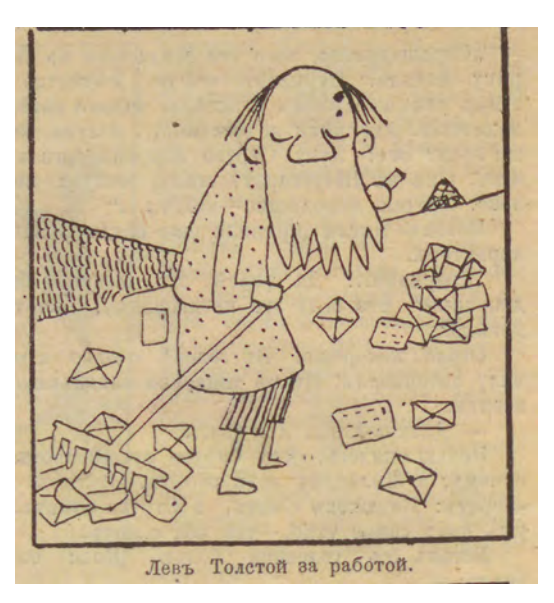
"Tolstoi at work" (Seryi volk, 23 March 1908, n. 12)

The ongoing debate in the press went hand in hand with an exponential increase in the mail arriving at Iasnaia Poliana. Tolstoi's archive in Moscow contains over fifty thousand letters addressed to him, still largely unpublished, reflecting the lively dialogue between Tolstoi and his contemporaries: almost half of these letters reached Tolstoi in the decade before his death, between 1900 and 1910; of these, over four thousand date back to 1908; of these, those that refer to the jubilee number 1,364. Even the periodicals publicized the extraordinary flow of letters addressed to Tolstoi, from Russia and from abroad, offering brief samples of their various types, and sometimes even indulging in satirical interpretations of the phenomenon.