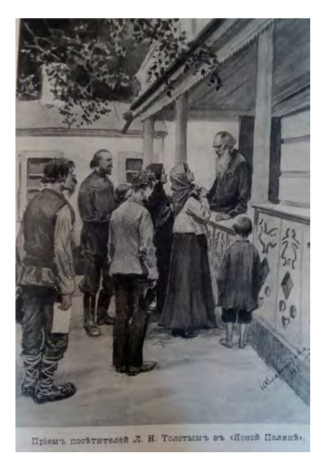
"Tolstoi's reception of visitors to Iasnaia Poliana" (Supplement to Peterburgskii listok, 28 August 1908)

L. N. Tolstym"); to the communication of a newspaper correspondent who had once been at Iasnaia Poliana and who now offered the reader a detailed chronicle of Tolstoi's daily routine—and, per the newspaper's inclination to scandal, a not precisely idyllic description of the living conditions of peasants at Iasnaia Poliana. The material on the jubilee ended with a contribution entitled "Tolstoi in Anecdotes" ("Tolstoi v anekdotakh"): according to a widespread practice, various kinds of news on Tolstoi were assembled here, strictly without indicating their sources, and casually placed next to the reports of a murder or a cholera epidemic in St. Petersburg. The supplement to Peterburgskii listok , in line with the newspaper's vocation as a champion of the rights of the meekest, emphasized Tolstoi's "humanitarian side." The images indeed seem to focus on Tolstoi's relationship with the poor and the needy: in one photograph, peasant children are shown sitting next to the so-called "tree of the needy" in Iasnaia Poliana, while another drawing immortalises Tolstoi in the act of meeting the poor on his estate's veranda.