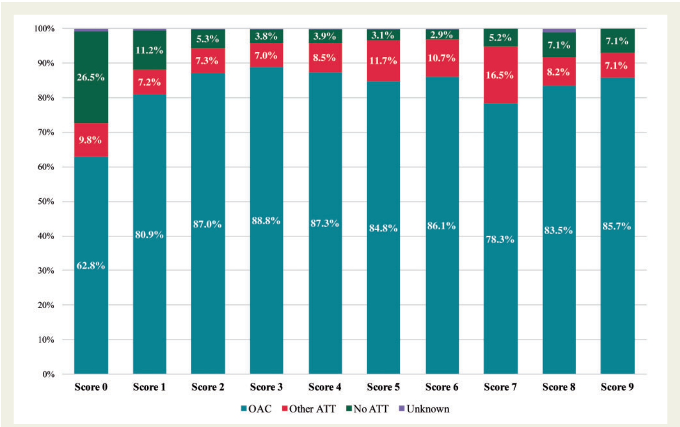
Figure I Proportions of patients treated with antithrombotic drugs by CHA_2DS_2 -VASc score. ATT, antithrombotic therapy; OAC, oral anticoagulant.