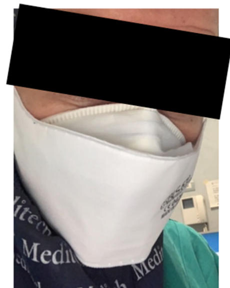
Fig. 3 FFP2 mask

Moreover, all non-intubated patients who are either infected, or suspected of infection, who arrive in the IR