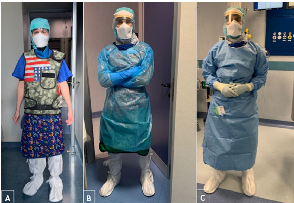
Fig. 2 A–C Operator wears shoe covers, cap, eyes protection and lead gown (A); face shield, repellent overall and gloves are worn above (B); operator wears sterile gown and gloves immediately before to start procedure (C)

procedures usually performed in an angiographic suite may include biopsy, fine needle aspiration, insertion of nasogastric or naso-jejunal feeding tubes, percutaneous gastrostomy, esophageal, gastric or duodenal dilatation and/or stenting, tracheal dilatation and/or stenting, and bronchial artery embolization (for the risk of heavy bouts of coughing due to hemoptysis) [5]. For thoracentesis or paracentesis sample preparations, transfer should be avoided, or if absolutely necessary, be performed with needle tip below fluid surfaces to minimize aerosolization. When carrying out these procedures on Covid-19 patients, the WHO recommends N95 or FFP2 standard masks or equivalent, and gowns, gloves, eye protection, aprons and shoe covers [4, 6]. N95 masks are equivalent to PPE masks, designed to achieve a very close facial fit and protect the wearer from airborne particles; they are tested to block at least 95% of very small ( 0.3 \mu ) test particles. FFP2 masks have a minimum of 94% filtration of particles ( 0.4 \mu ) percentage (Fig. 3).