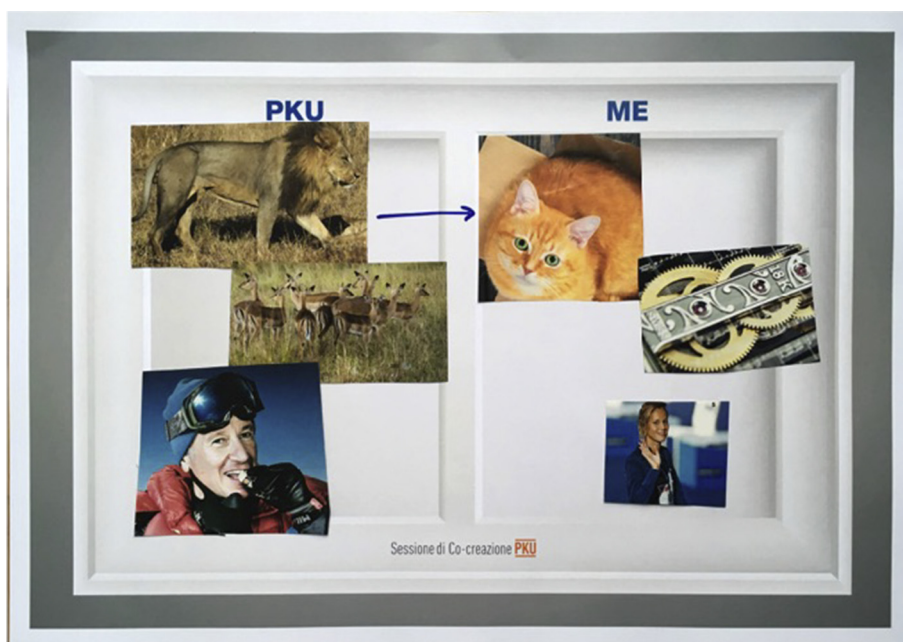
Fig. 2. Exemplar image of the co-creation exercise ‘PKU & me’ on the emotional experience and attitudes of non-adherent PKU patients.

In fact, one of the most oppressing problems seemed to be related to the possibility to travel safely and autonomously (travel meaning any place outside familiar local territory): participants reported a strong difficulty in managing the diet outside the home due to the fact that the information about the nutritional values of foods are often difficult to find and calculate. Other difficulties involving the diet management emerged: protein-free foods are available only in pharmacies; restaurants are not prepared for the provision of protein-free food. Another aspect that emerged is the perception of being obliged to continuously plan life. Simple things like where to have lunch but also bigger decisions like a pregnancy, (the female members of all three teams referenced and understood the need to plan pregnancy to avoid fetus