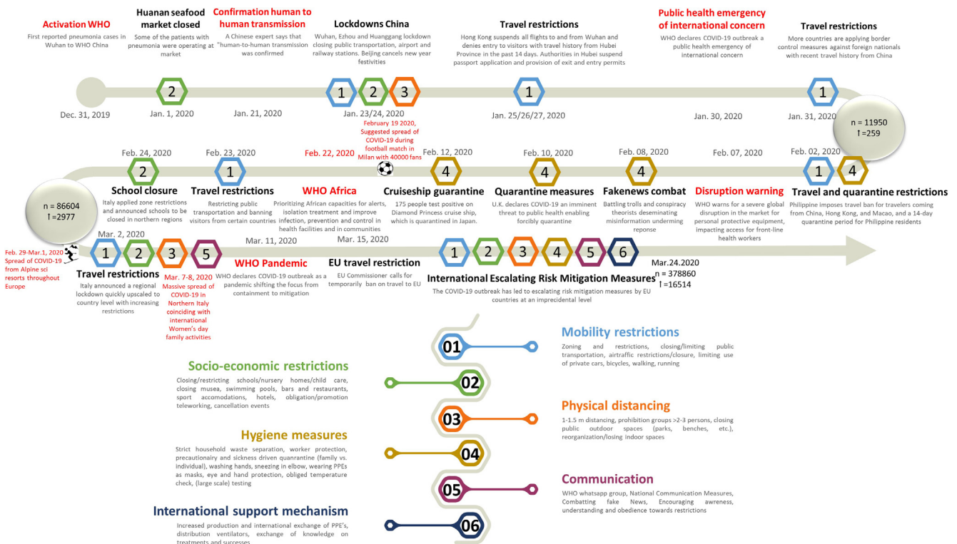
Fig. 2. Time line of events and application of COVID-19 risk mitigation measures.

cure or a vaccine, controlling the infection to prevent the spread of COVID-19 was correctly seen as the only intervention that could be used (Lai et al., 2020). Consequent risk mitigation measures were soon after announced in Wuhan (holiday extension, city lockdown, quarantine requirements) (Lin et al., 2020) and in neighbouring cities and regions. Other areas and countries such as Hong Kong, Taiwan, South Korea and Mongolia followed with almost daily announcements of ever more strict risk mitigation measures to limit the spread. These comprised of travel restrictions, isolation of travellers coming from the Wuhan region, closure of schools and universities and the prescription of hygienic measures (see the timeline of the events in Fig. 2). On January 30, 2020 the WHO Emergency Committee convened for a