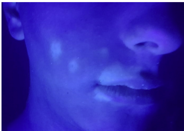
Figure 2 Wood's light examination revealed fluorescence bright blue-white in malar and perioral right regions.