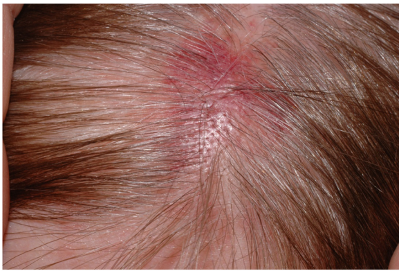
Figure 1 Erythematous plaque with recent onset at the top of a 60 year-old woman.