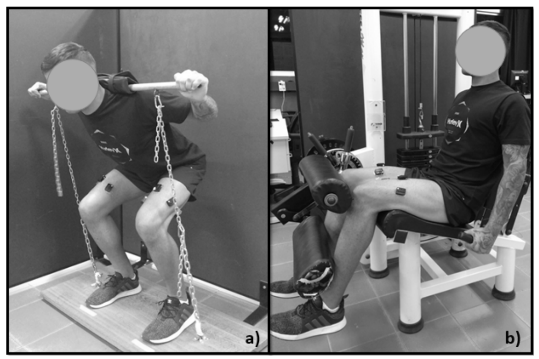
Figure 2. Conditioning exercises: a) isometric back squat; b) isometric knee extension

angle [26]. During the jumps, the subjects squatted until they could feel the bar on their posterior thigh, and then remained static some seconds before performing the positive phase as fast as possible.