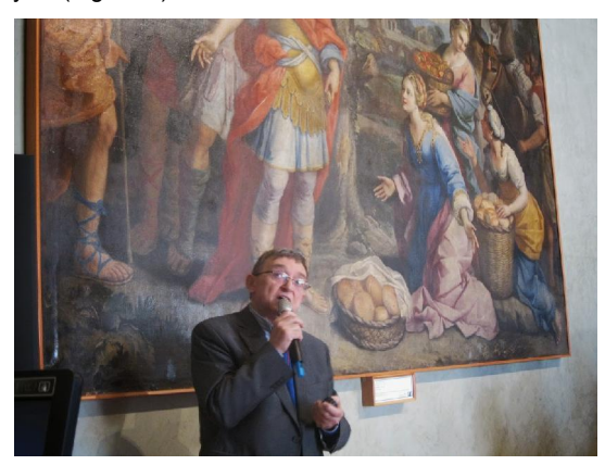
Figure 8 Professor Serge Kaliaguine giving a lecture on mesoporous titania-modified silicas as epoxidation catalysts at FineCat 2014, Palermo, Palazzo Steri, April 2, 2014.

On the same day, Serge Kaliaguine described the chemical behaviour of newly prepared Ti-SBA-15 silicas in epoxidation catalysis (Figure 8). ^{[30]}