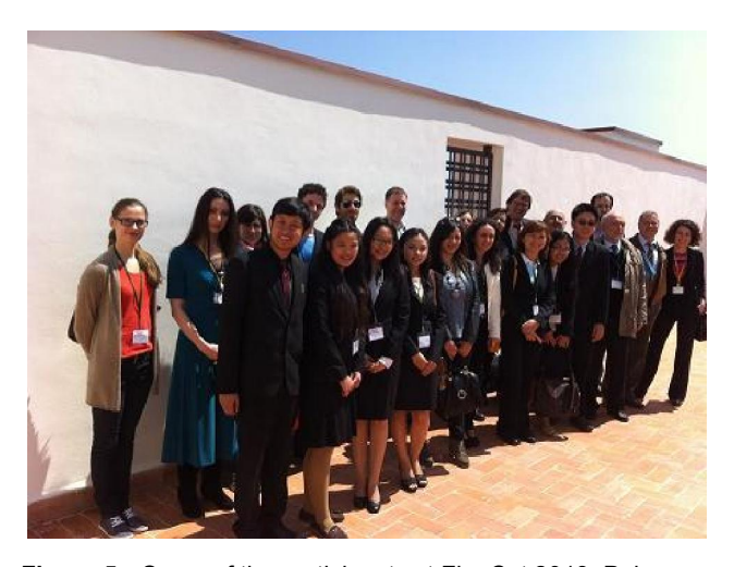
Figure 5 Some of the participants at FineCat 2013, Palermo, Palazzo Steri, April 10—11, 2013.