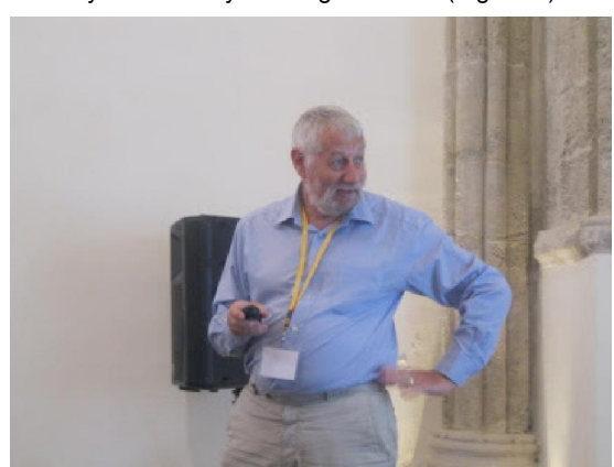
Figure 3 Professor Graham Hutchings giving a lecture on catalysis with gold and gold palladium nanoparticles at FineCat 2012, Palermo, April 18, 2012.

Anticipating subsequent advances in single-atom catalysis concerning also gold,<sup>[15]</sup> Professor Hutchings underlined how recent aberration-corrected microscopy studies on the nature of the active site for CO oxidation had revealed that the active species may involve only 7—10 gold atoms (Figure 3).<sup>[16]</sup>