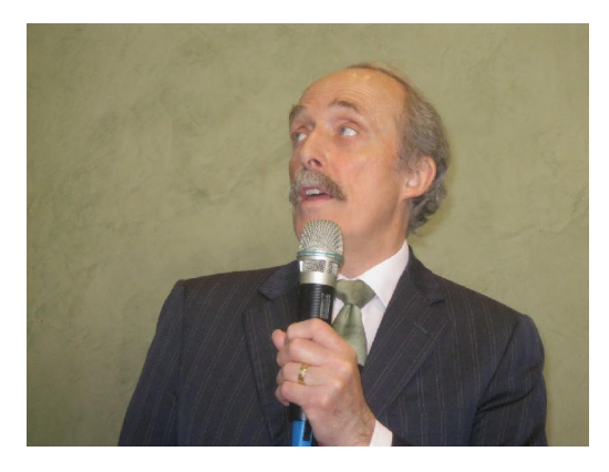
Figure 7 Professor David Cole-Hamilton giving a lecture on homogeneous and heterogeneous catalysis under flow at FineCat 2014, Palermo, Palazzo Steri, April 2, 2014.

Reactions covered included the hydroformylation of alkenes to give linear aldehydes, metathesis of methyl oleate, asymmetric hydrogenation to give a product which is a solvent free pure enantiomer and the first ever hydrogenation of amides to amines, [27] a particularly difficult reaction, of considerable interest in the pharmaceutical industry.