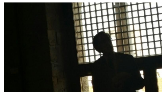
Figure 11 Professor Manfred Reetz giving a lecture on directed evolution of enantioselective enzymes as a source of powerful catalysts for asymmetric reactions at FineCat 2015, Palermo, Palazzo Steri, April 8, 2015.

In the 1990s, Reetz' team firstly stabilized and greatly enhanced the lipase activity by encapsulating the enzymes in ORMOSIL matrices, [39] and then presented proof-of-principle of directed evolution of stereoselectivity as a protein engineering technique comprising repeating cycles of gene mutagenesis, expression and screening for a given catalytic property. Targeting massive industrial adoption of biocatalysis, the aim was and is to expand enzyme limited substrate scope, and poor stability under operating conditions. [40]