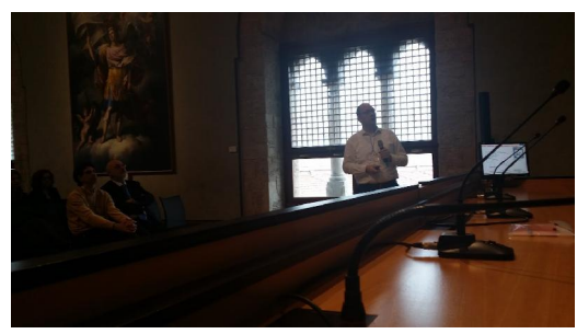
Figure 16 Professor Bert Sels giving a lecture on biomass conversion into valued molecules using Lewis acid catalysis with tin-modified silicas and zeolites at FineCat 2016, Palermo, April 7, 2016.

Professor Bert Sels in Katholieke Universiteit Leuven in Belgium, one of the world's leading chemistry scholars in biomass conversion into valued molecules, discussed how shape selective zeolites as well as zeolites and structured mesoporous silicas functionalized with single-site Sn catalytic centers tetrahedrally incorporated can be used as a highly effective heterogeneous Lewis acid catalysts in a wide range of sugar and other biomass-derived substrates conversions (Figure 16). [55]