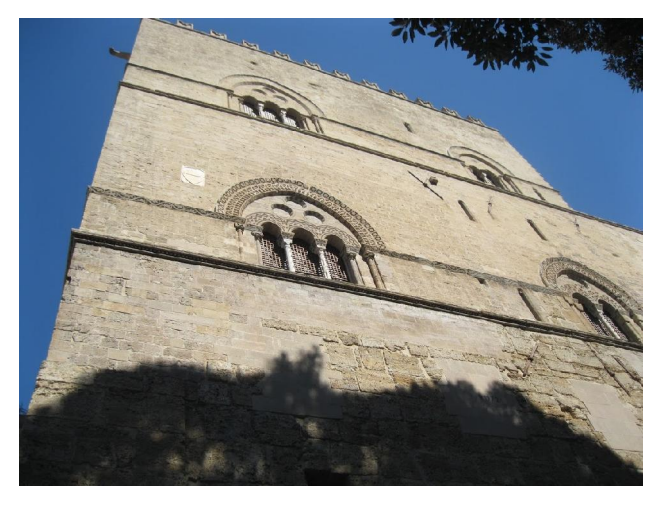
Figure 6 Palazzo Steri, site of five out of six FineCat symposium editions, photographed during FineCat 2013, on April 10, 2013.