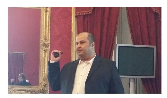
Figure 19 Professor Raed Abu-Reziq giving his lecture on nanostructured materials, nano-and microreactors as platform materials for heterogeneous catalysis at FineCat 2017, Palermo, Palazzo Reale, 5 April 2017.

In brief, Professor Abu-Reziq showed how ionic liquids (IL), polyethylene glycol (PEG) or deep eutectic solvents (DES) can be encapsulated within silica shells, thereby particulating ionic liquids, DES or PEG and converting them in powder form (Figure 19).