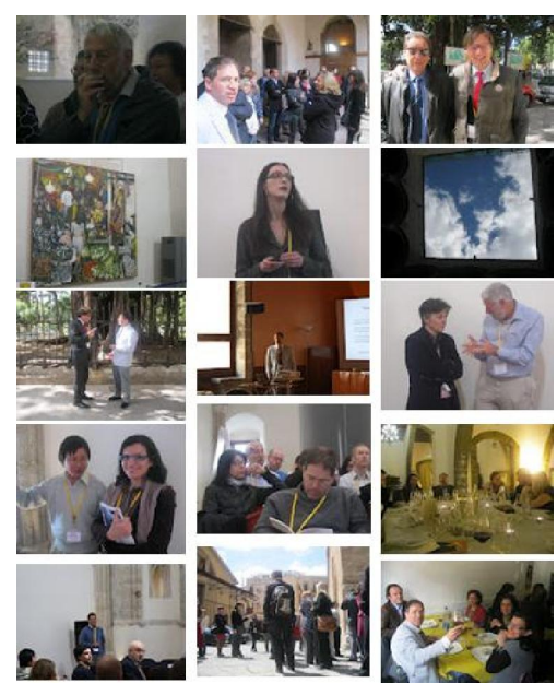
Figure 2 Snapshots from the first "FineCat-Symposium on heterogeneous catalysis for fine chemicals" held in Sicily, April 18—19, 2012.

unsophisticated approach for screening heterogeneous catalysts.