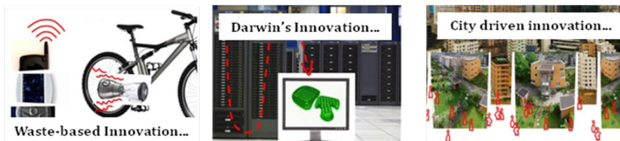
Figure 2: Three INFU Contrasted Visions

INFU is exploring the future of innovation in a bottom up approach (figure 1). In the first phase, all sorts of observations of striking innovation practices were collected in a loose and open manner. From these signals of change, 20 contrasted visions on the future of innovation were generated by clustering and “amplification” (figure 2). These provocative projections were discussed with actors with different perspectives on innovation patterns through interviews and an online survey. On the base of all reactions on the contrasted visions seven “nodes of change” were identified.