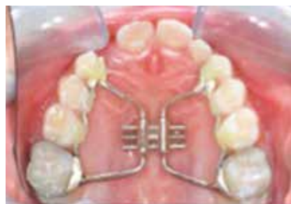
FIG. 1 Rapid maxillary expander (RME).

Descriptive statistics for each measurement were calculated to enable characterisation of both groups. At first, for each variable, the difference (variation) between the