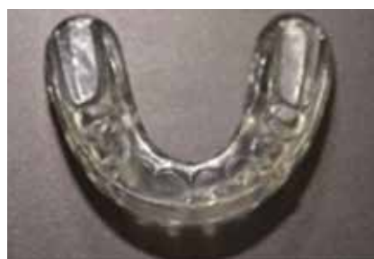
FIG. 2 Eruption guidance appliance (EGA).

values at T2 and T1 was calculated. Then, a Student t test for independent samples was performed to detect significant differences between the variations of each measurement between groups. The P value of < 0.05 was considered significant.