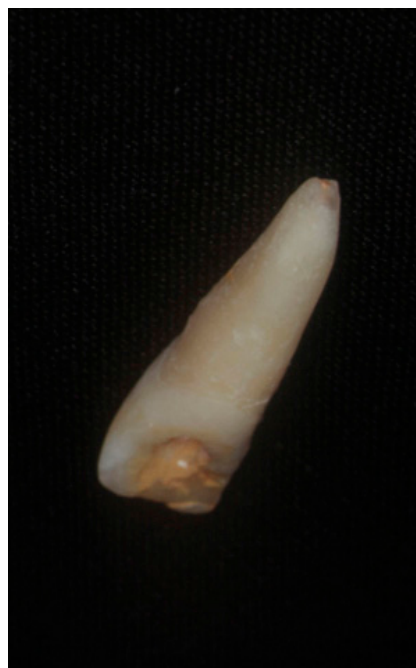
Figure 2. Tooth 11 after root planing, pulpectomy, and filling with gutta-percha and sealer.

The fragment of tooth 21 was discovered inside the swollen and lacerated upper lip. No other oral injury was detected clinically. Examination of the avulsed tooth showed an uncomplicated crown fracture and necrotic periodontal ligament cells due to the prolonged dry storage. After the parents' informed consent, the root of the avulsed tooth was planed to remove the necrotic periodontal tissue, and was then filled with gutta-percha and sealer after pulpectomy (Figure 2).