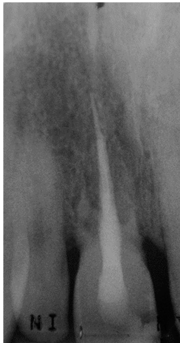
Figure 9. Rx at the 10-year recall visit.

Finally, 16 years after the trauma (Figures 10 and 11) the patient was scheduled for an orthodontic and implanto-prosthetic rehabilitation.