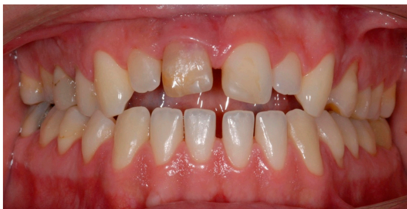
Figure 11. Intraoral view 16 years after delayed replantation of tooth 11.