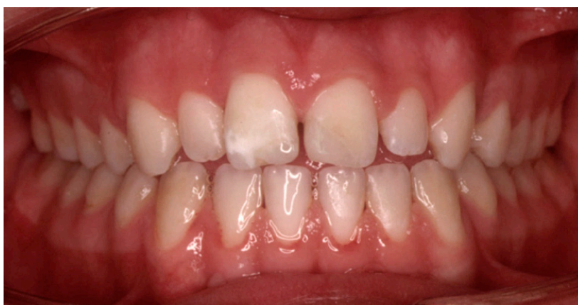
Figure 4. Intraoral view when the splint was removed (three weeks after injury).

The splint was removed 3 weeks later and the fractured crown of tooth 21 was restored with composite resin (Figure 4).