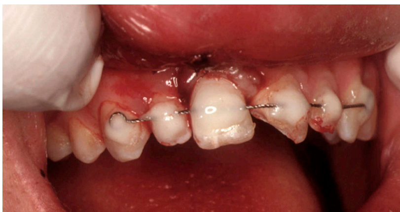
Figure 3. Intraoral view after replantation and functional splinting of tooth 11.

The fractured crown was restored with composite resin. A local anaesthetic was administered to remove the contaminated coagulum from the socket prior to pushing back the tooth with a gentle pressure. A functional splinting with an orthodontic 0.014-inch braided stainless steel wire and composite resin was positioned from tooth 13 to tooth 23 (Figure 3) and left in place for 3 weeks. Fragment of tooth 21 was not utilized to restore its fractured crown, and a seal against bacterial invasion into its dentinal tubules was created using a dentin bonding agent. The proper positioning of tooth 11 was confirmed with a periapical radiograph. Tetanus prophylaxis was not necessary. A 7-day treatment of systemic amoxicillin (2 g for day) and an analgesic on demand were prescribed at the Hospital Emergency Unit. Finally, strict instructions were given to the patient about soft diet for 1 week and oral hygiene (soft toothbrush after each meal and mouth rinsing twice a day with 0.12% chlorhexidine) for the entire splinting period.