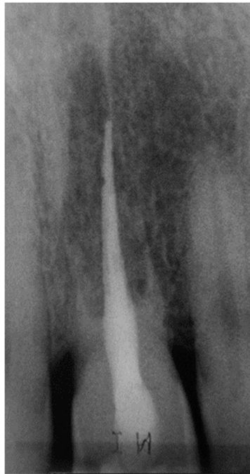
Figure 7. Rx at the 4-year recall visit.