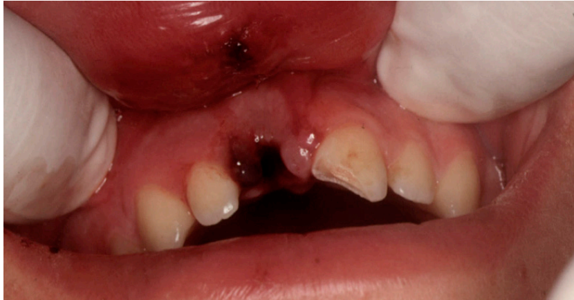
Figure 1. Intraoral view at the time of traumatic injury.

A healthy 15.2-year-old male arrived at the dental office coming from the Hospital Emergency Unit 18 h after a facial trauma due to a bicycle accident. Intraoral examination revealed avulsion of tooth 11 and an uncomplicated crown fracture of tooth 21 (Figure 1).