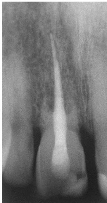
Figure 8. Rx at the 7-year recall visit.