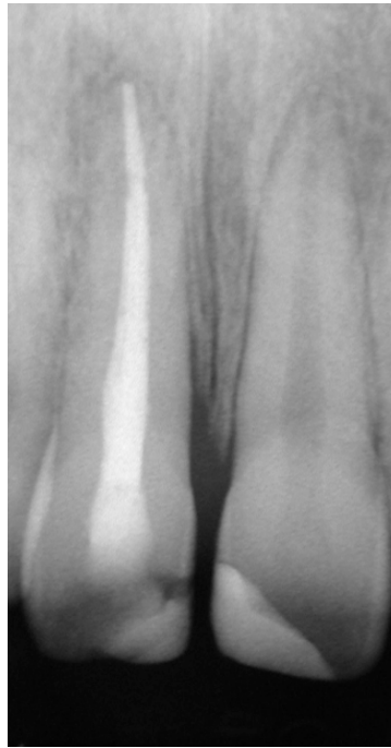
Figure 5. Rx at the 3-month recall visit.

crown, and an anterior open bite, the patient was encouraged to undergo a comprehensive treatment that he previously always avoided.