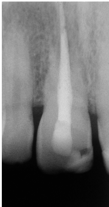
Figure 6. Rx at the 2-year recall visit.