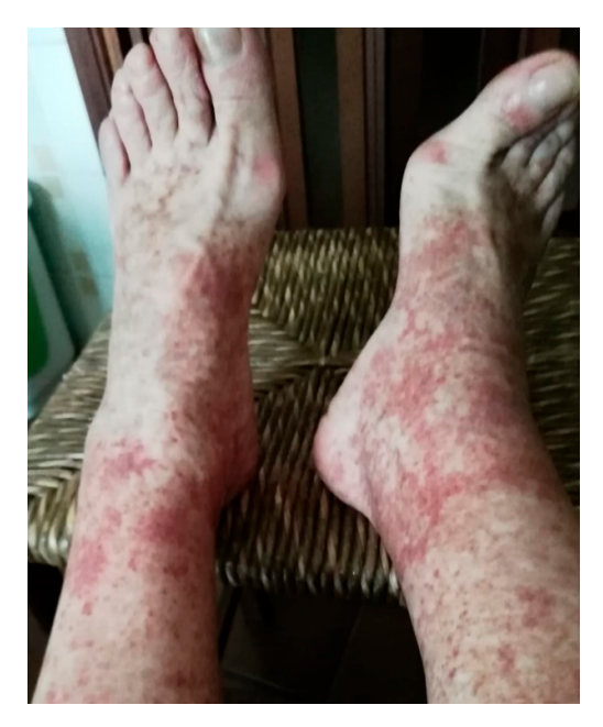
Figure 2. Purpuric manifestations in the legs after successful therapy with DAAs.

Finally, we suggest that serum creatinine and urinary abnormalities should be monitored with accuracy in all patients after antiviral treatment with DAAs. New–onset or relapsing glomerular disease has been noted by some authors in patients who achieved SVR with regimens based on DAAs [18–20]. Figure 2 shows purpuric manifestations in the lower limbs in a patient with HCV-related cryogobulinemic patient who received DAAs. After DAAs, the patient obtained SVR but cryoglobulins remain detectable in serum. The patient suffered from frequent and spontaneous episodes of purpura over the observation period (i.e., three or four times a year). Purpura disappeared spontaneously in most cases.