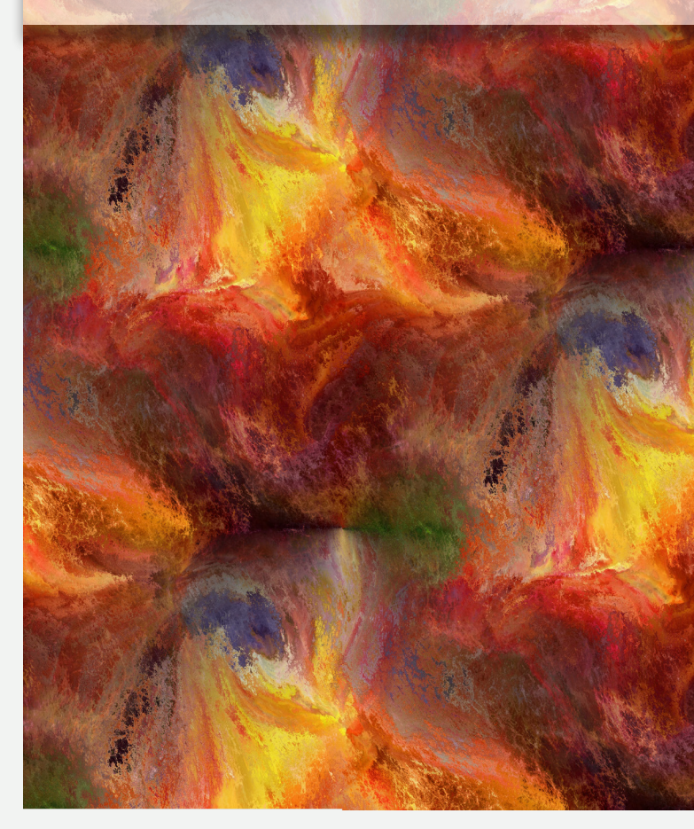
NewHums Research Centre – Neurocognitive and Humanities Studies International NeuroHumanities Studies Network University of Catania