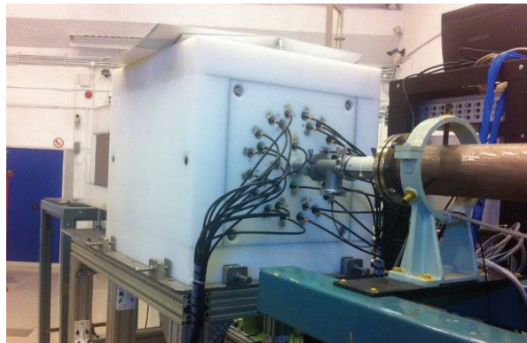
FIGURE 3. ELIGANT-TN array mounted at IFIN-HH for commissioning experiment.

At the preparatory phase, ELI-NP team was strongly involved in measurements at NewSUBARU facility under the PHOENIX collaboration that was established to perform experimental part of Coordinated Research Project on Photonuclear Data and Photon Strength Functions launched by IAEA. Total and partial cross section of ( \gamma, xn ) with x=1, \dots, 4 for ^{209}\text{Bi} , ^9\text{Be} , ^{197}\text{Au} , ^{169}\text{Tm} , ^{89}\text{Y} , ^{181}\text{Ta} , ^{165}\text{Ho} , ^{59}\text{Co} , ^{159}\text{Tb} , ^{139}\text{La} , ^{103}\text{Rh} were measured. First case for ^{209}\text{Bi} nucleus was already published [34].