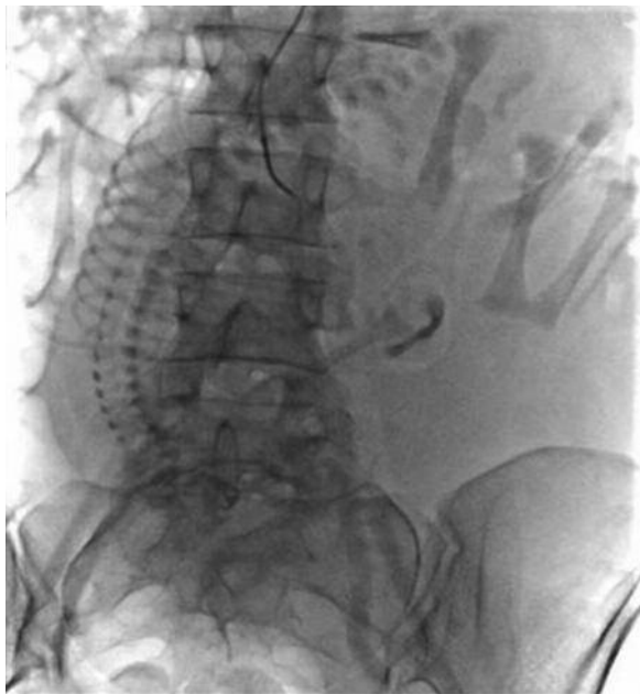
Figure 1. Angiography with low concentration contrast medium demonstrates the correct right femoral access with opacification of right iliac artery.

After preparation of the patient, a mobile C-arm (OEC 9800 Plus, GE) and a special truck with materials for interventional angiography were transferred to the operating room for the planned caesarean section.