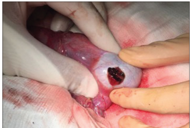
Figure 2: Macroscopic features during surgery: no testis discoloration or torsion of the spermatic cord is observable, whereas a clot-like nodule, surrounded by normal parenchyma, is easily recognized under the tunica albuginea

A 36-year-old male presented with a 1-day history of acute right-sided testicular pain. His medical history was marked by an episode of paroxysmal atrial fibrillation regressed with flecainide 3 years earlier, hemorrhoidectomy 7 years earlier for several episodes of hemorrhoidal thrombosis, and a recent finding of patent foramen ovale. He had undergone screening for thrombophilia with mild positivity for anti-beta-2 glycoprotein 1 immunoglobulin G (IgG) (21 U/mL). The testis was tender on palpation, and all