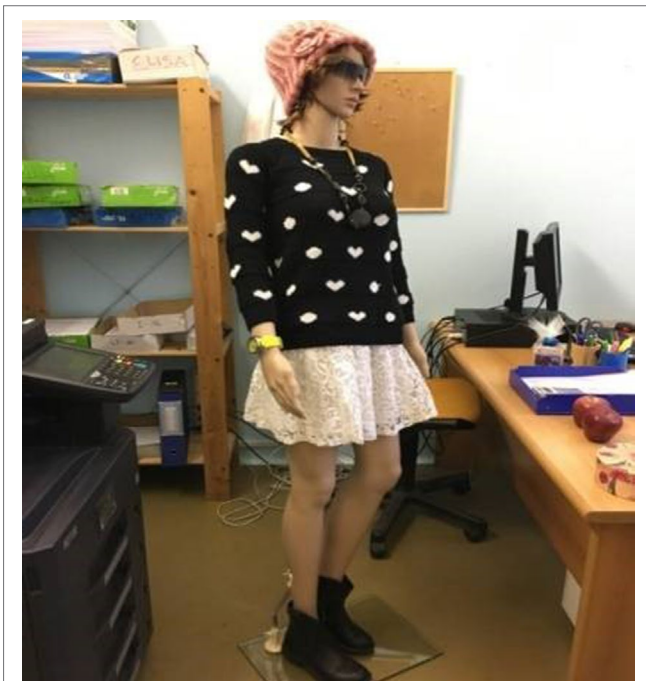
FIGURE 2 | Mannequin used in the mock crime scene.

During the kinematic test, a second infrared thermographic image was taken for a comparison with the baseline image previously made. At the end of kinematic session, a self-filling computerized two forced-choice task (SVT) was administered