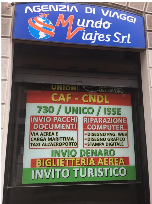
Figure 8. Shopfront. Mundo viajes travel agency (left).

owners are Peruvian. In this case, the language choice favours Italian, which is dominant in the subunit on the left, where all the services are listed in Italian.