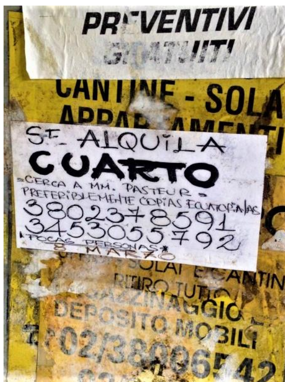
Figure 12. Personal Advert.

Figure 12 shows the stratification of signs in the informal LL, which expands into the interstices of the urban space. Spanish is by far the most represented language in the informal sphere, which includes event flyers, political posters, personal messages, advertisements and other typologies.