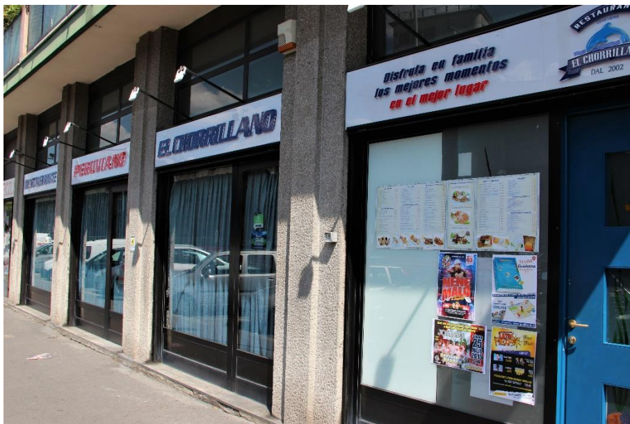
Figure 6. Shopfronts. Chorrillano restaurant.

The name of the Chorrillano restaurant (Figure 6) is not immediately explicable to Italians or others who see it, since it refers to a non-touristic, coastal district of Lima, thereby underlining its seafood speciality. Nor can the words on the main sign be interpreted easily, pointing out the symbolic value of a social space: Disfruta en familia de los mejores momentos en el mejor lugar ('Enjoy the nicest moments in the nicest place with the family'). In an interview, the owner explained to us that the previous display emphasized the quality of the food (especially the ceviche ), but now, with the greater familiarity with that dish, he prefers to appeal to a quiet, family clientele.