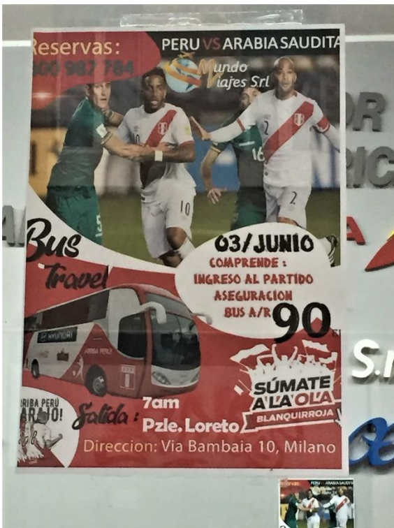
Figure 11. Football match trip poster.

Thus, the social actors involved are expected to position themselves between two languages, and to select one of them according to its transactional and/or symbolic