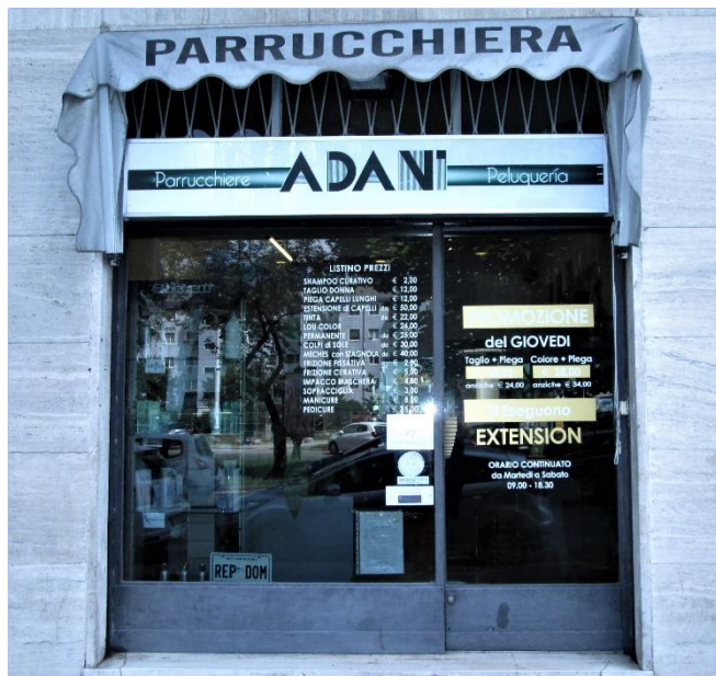
Figure 2. Shopfront. Adani hairdresser salon.

and the shop seems Italian, judging by the services advertised, the sobriety of the colours used and the graphics in the shop window.