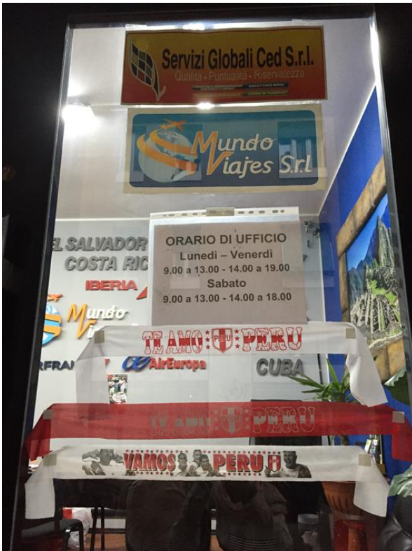
Figure 10. Peruvian patriotic banners.