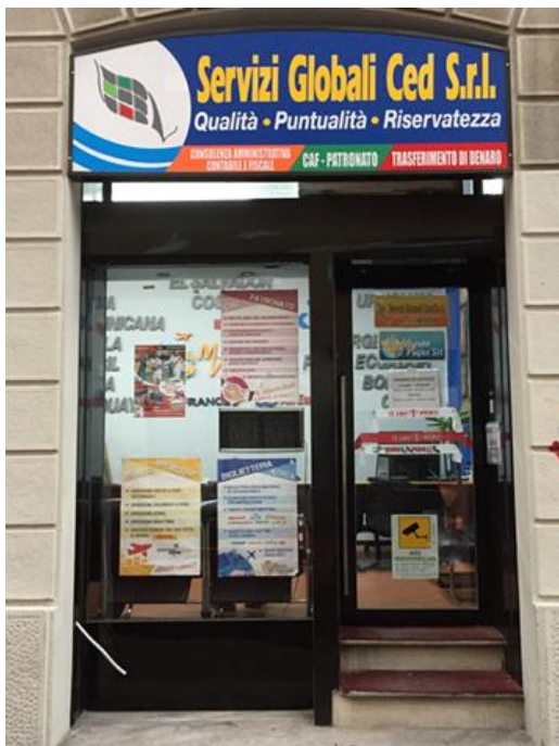
Figure 9. Shopfront. Mundo viajes travel agency (right).

The use of Italian is generally correct but reveals the influence of Spanish, for instance, in the case of carga marittima (Sp. carga marítima , It. cargo marittimo ,