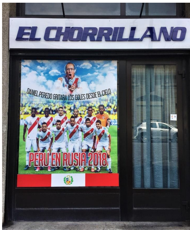
Figure 7. Peruvian national football team poster.

The following picture (Figure 7) was taken in June 2018, when a special event caught the attention of the community: the participation of the Peruvian national football team in the World Cup. The poster announcing this event occupies the whole of a subunit which usually only displays the restaurant's name. Above the team floats the figure of Daniel Peredo, a football commentator who died a few days before the start of the World Cup, and who "will shout out the goals from heaven" ( gritará los goles desde el cielo ). This iconographic representation, also widespread in social networks, underlines and strengthens the transnational connection between the various Peruvian communities at home and across the world.