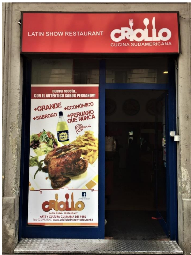
Figure 5. Shopfront. Criollo restaurant.

The generic offer of South American cuisine takes on a more precise target recipient in the design of the main shop window, which boasts Peruvian specialities. The display includes a set of signs, both verbal and iconographic, indexing Peruvian identity, such as the new country brand logo, with its spiral “P”. A large centrally located roast chicken and chips, a favourite dish within the community, is accompanied by a bottle of Inca Kola, a national beverage. Other verbal elements emphasise the principal merits of this dish for the community: flavour, low cost and authenticity ( Auténtico sabor peruano , ‘Authentic Peruvian taste’; más sabroso , ‘tastier’; más económico , ‘cheaper’), but at the same time it tempts members of the wider community interested in new taste experiences with ethnic cuisine. This is especially apparent in the final statement: Arte y cultura culinaria del Perú (‘Peru’s culinary art and culture’). Thus, the language used embodies a guarantee of authenticity. Within the LL, different