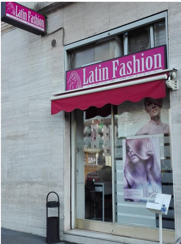
Figure 3. Shopfront. Latin Fashion hairdresser salon.

The second hairdressing salon is located a few meters away and is run by two women from Ecuador and El Salvador (Figure 3). Latin Fashion has a bilingual Italian-English display, where Spanish is absent. However, the adjective Latin refers clearly to the linguistic and cultural dimension of Latinos , without specifying any nation and thus marking the shop as a social hub for LAs.