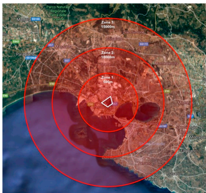
Figure 1. Geographic description of the residential zones (circles) used to define participant proximity to the industrial complex (polygon).

To categorize residential location, the Taranto municipality was divided geographically into three concentric residential zones (1, 2, 3) of increasing radial distance from the industrial complex. The industrial complex was defined as a polygonal region in which processes of steel preproduction (including iron ore extraction), production, and refinery were performed regularly (Figure 1).