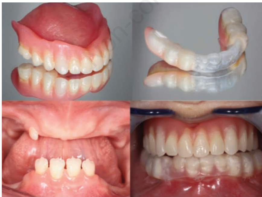
Figure 2. Upper and lower dentures and intra-oral pictures before and after the insertion of the dentures.