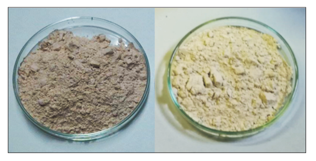
Fig. I – Appearance of the powders of Ben (left) and Zeo (right) materials.