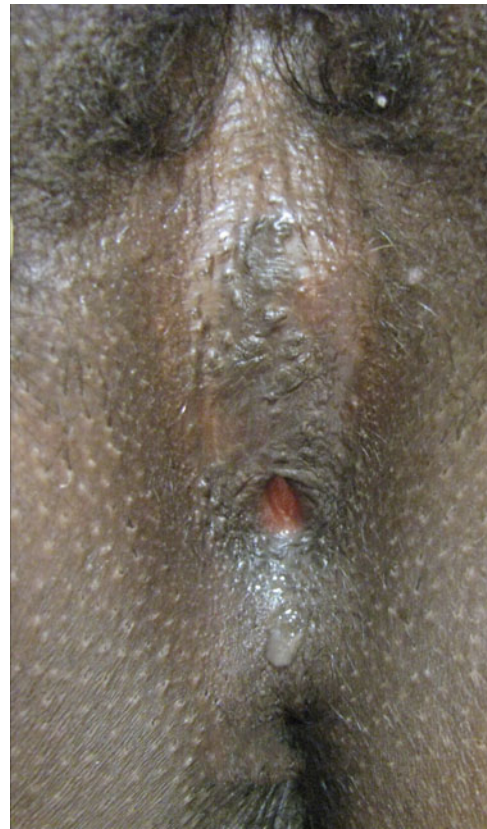
FIG. 2. Twenty-one year old nulliparous woman with a female genital mutilation type IIIb.

III) is performed in 15% of cases (Fig. 2), although with great variability among countries. 1