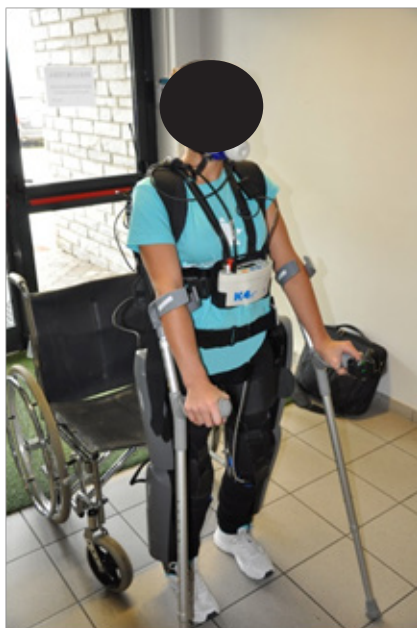
Figure 1 Experimental protocol

(STAND) wearing the exoskeleton. During both these periods heart rate (HR) and respiratory gases concentration were assessed on a breath-by-breath basis with a HR monitor (Polar s810, Polar, Finland) and a calibrated portable calorimeter (K4b 3 , Cosmed, Italy). The walking session took place thereafter. HR and gas concentrations were assessed during locomotion with the exoskeleton (EXO) and with the wheelchair (WHCH) maintaining two different self-selected velocities 3 : the most comfortable speed (CS) and a slower speed (Low Speed, LS), both maintained for at least 4 min during back and forth locomotion on a 25-m length linear flat path.