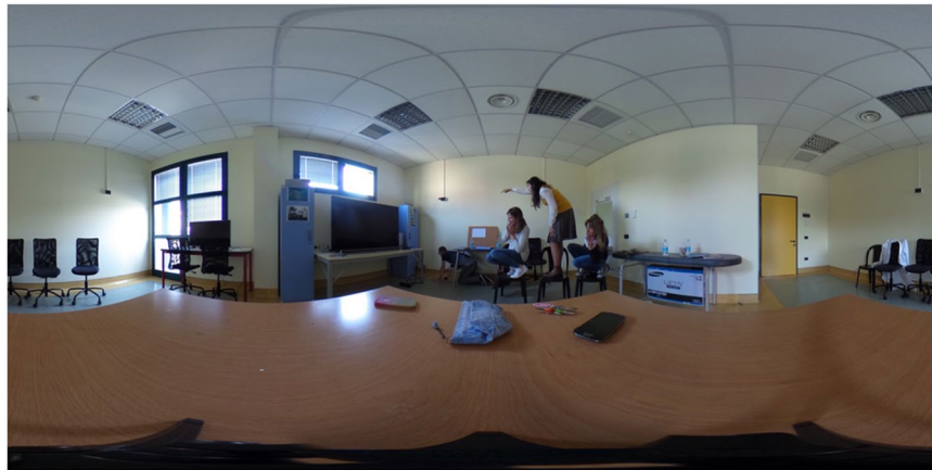
Figure 4. PIT 360°. Testing phase.