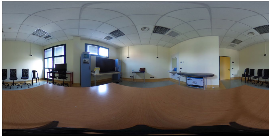
Figure 3. PIT 360°. Familiarization phase.

Procedure of the study. Participants underwent a conventional neuropsychological assessment to obtain their global cognitive profile and level of executive functioning (pre-task evaluation). Subsequently participants were asked to complete the PIT 360° (PIT 360° session). The PIT 360° was designed and administered through an innovative mobile application (PIT 360) that allows participants to explore an immersive 360° experience. At the end of PIT 360 task evaluation, subjects were asked to rate their affective reactions, perceived levels of challenge and skill, appreciation and sense of presence experienced while performing the PIT 360 task (post-task evaluation).