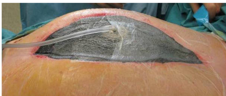
Fig. 3 Aspiration system could be placed over the eventual continuous traction system

Which is the best and the correct management of a patient with OA nowadays is still unclear: the technique is relatively new and in the literature the data and the casuistic reported are too various and too heterogeneous to assess. With these criticisms the techniques seemed to be associated with the best rate of primary closure and minor complication rate are the Negative Pressure Wound therapy and the Wittmann patch but grounded data are needed [61, 62].