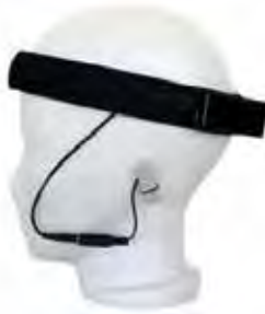
Fig. 2: MindCap XL Headband positioned over Fp1.

EEG signal was acquired by using a MindCap XL Headband (Neurosky). The tool consists of an elastic band with due electrodes: the active one was positioned over Fp1, and the reference electrode over Fp2. Also, a clip to be attached on the left earlobe was present. The system was battery powered and the signals were sent via Bluetooth to a computer that recorded them through the NeuroView software. The sampling frequency was 512 Hz for the filtered signal and 7 Hz for the Power Spectrum reporting the frequency of all brain waves with a range of 4 Hz (Delta 0-4 Hz, Theta 4-8 Hz, Alpha 8- 12 Hz, Beta 18-22 Hz, GammaLow 28-32 Hz, GammaHigh 38-42 Hz) (see Fig. 2).