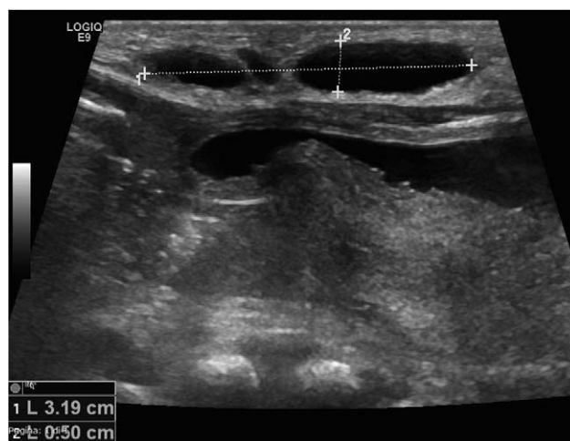
Figure 1. Abdominal ultrasound scan showing subcutaneous cysts. 1: maximum diameter 3.1 cm, 2: minimum diameter 0.5 cm.

On the second day of life the abdominal US was performed, and no congenital urachus abnormalities were detected, but rather some hypo-anechoic cysts of about 3.1 × 0.5 cm that extended from the umbilical to the right inguinal area, reaching the medial surface of the thigh, with a little extremity just above the homolateral knee (Fig. 1). The Doppler technique showed some vascular signals from the adipose tissue where these cystic lesions were located. A magnetic resonance imaging (MRI) scan with contrast was then performed. In consideration of the age of the patient, sedation was needed during the exam. At MRI, several lacunas with cystic appearance were observed in the subcutaneous adipose tissue of the right lower abdomen. These structures had variable size (maximum 3 cm of diameter) and were hypointense in T1 and hyperintense in T2 sequences. Cysts seemed to be restricted to the subcutaneous tissues since no signals of muscular or abdominal cavity involvement were evident. After the intravenous contrast administration, no significant enhancement of the cysts' content was seen. All MRI characteristics confirmed the diagnosis of multicystic lymphangioma (Fig. 2).