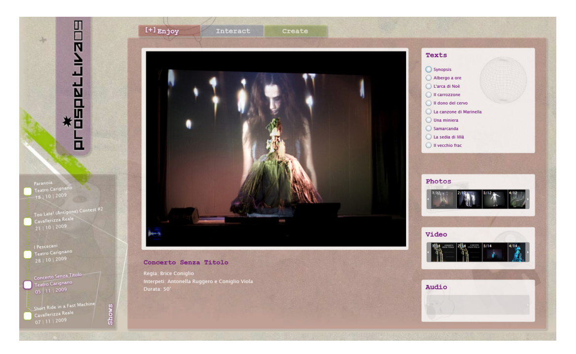
Figure 4. The interface of a web application for the multi-layer fruition of live shows.