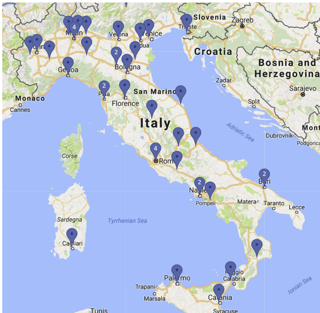
Fig. 1. Map of the location of clinical centers of LIPIGEN Network in Italy.