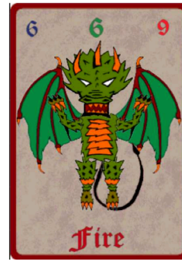
Figure 1. An example of Monster Card . In the bottom area it is indicated the natural element of the monster. The attack, defense and vital forces of the monster are shown in the top area.

The main contents of MOD are the Monster Cards , depicting different kinds of monsters, using a graphic style inspired by grimoires and medieval manuscripts. Figure 1 shows an example of Monster Card . Each card is composed by three areas: in the bottom area it is indicated the natural element of the monster; in the central area it is depicted the monster, and,