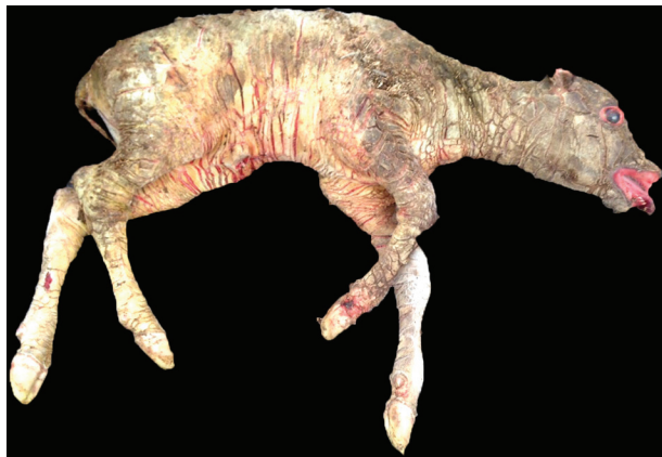
Figure 1. Shorthorn calf displaying characteristic features of ichthyosis fetalis including everted eyelids and lips, and hard plaques across the entire body.

incubated at 60°C for 30 min, followed by inactivation at 100°C for 10 min.