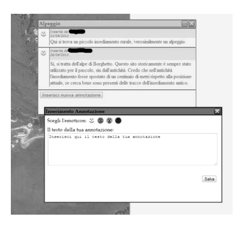
Fig. 3. Annotations from the users (up) and the interface to reply to an annotation(down).

Some days later an local resident of the valley decides to reply to the tourist's annotation, explaining that the rural complex is actually called "Alpeggio of Borghetto", and gives information about how this site is used. She also writes that, very close to this site there must be some archaeological evidences of a human settlement (Fig. 3).