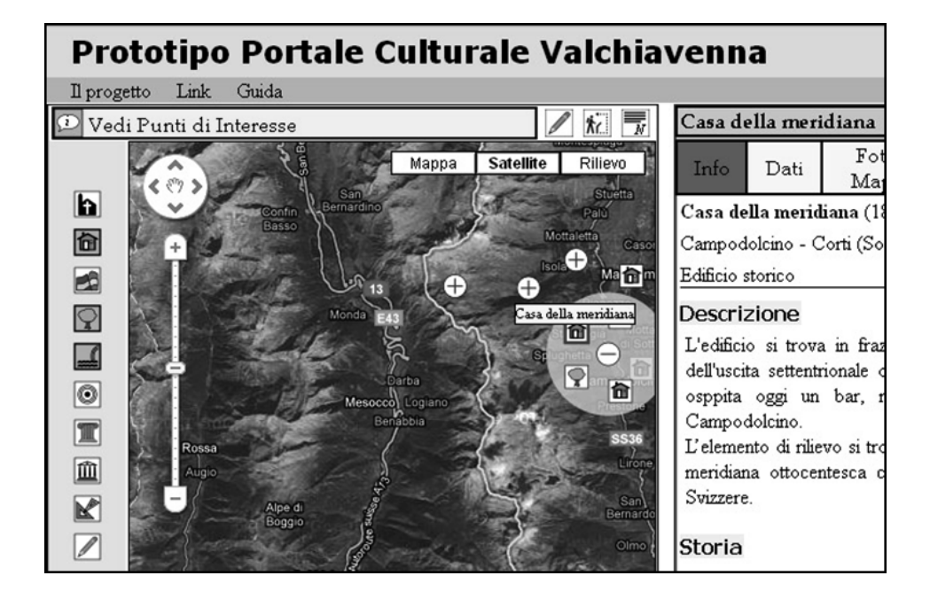
Fig. 1 . The system using a geographical map of Valchiavenna valley, on which some points of interest are visualized.

This project, named The Valchiavenna Project, aims at the conservation and valorization of the historical, artistic and naturalistic heritage of Valchiavenna valley, in the Italian Alps. One of the goals of the project was the development of a Web portal for the valorization of tangible and intangible cultural assets. Many different partners were involved in the project: the local community, geographers, geologists and the computer science department. This interdisciplinary collaboration is supported by the Web portal (Fig. 1) that offers three user profiles, which are allowed to perform different operations: Unregistered visitors, registered users and Experts.