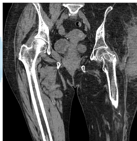
Figure 2: CT scan documenting sub-capital fracture of the femur