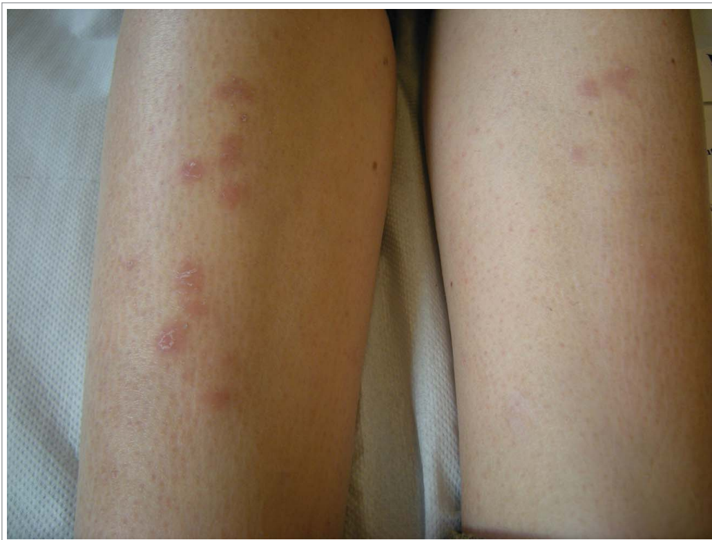
Figure 1. Erythematous and subcutaneous nodular lesions at the lower limbs.