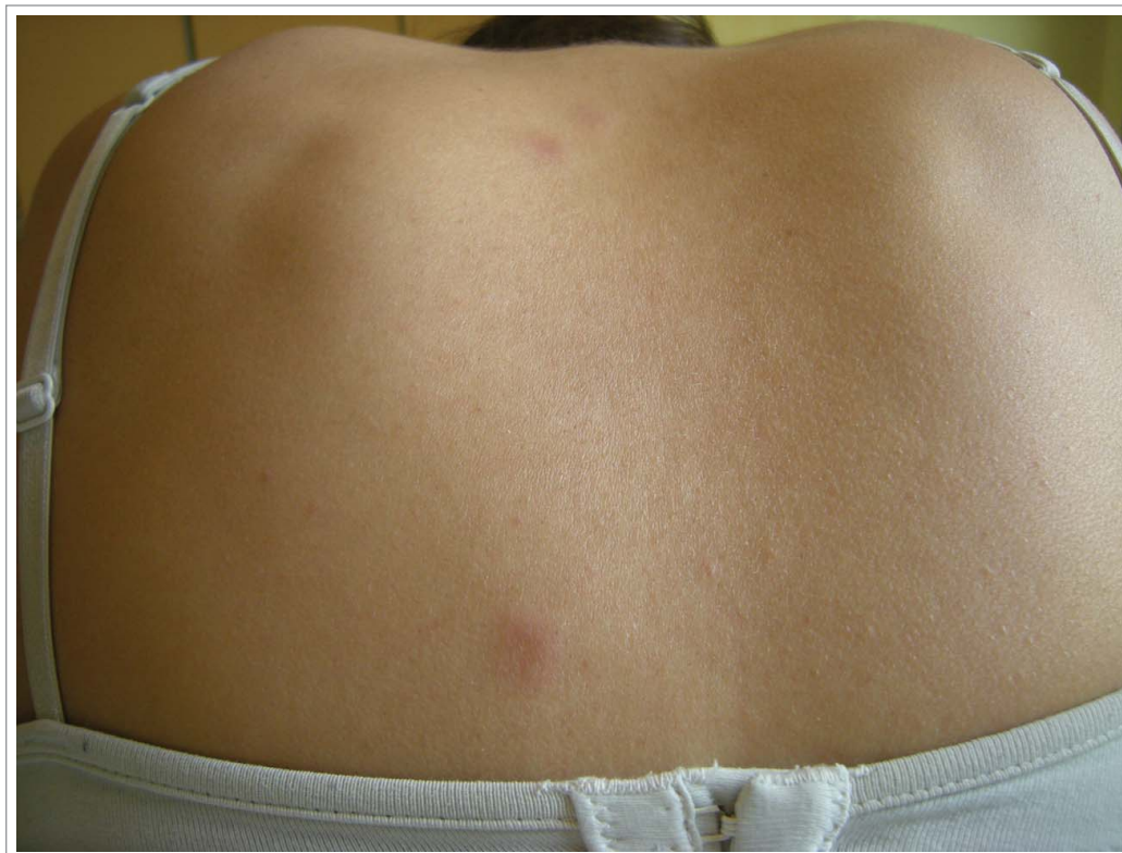
Figure 2. Erythematous and subcutaneous nodular lesions at the intrascapular region.

self-management education was reinforced and her HbA1c showed a gradual reduction.