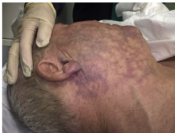
Fig 1. Cyanosis and patchy discoloration of the skin of the right hemiface secondary to external carotid artery (ECA) thrombosis.

A 64-year-old man arrived at the emergency department of our institution at 6:00 PM. Symptoms started at 3:00 PM with increasing pain localized in the lingual and masseter regions. Pain rapidly worsened and extended to the zygomatic and temporal areas with development of tongue numbness and