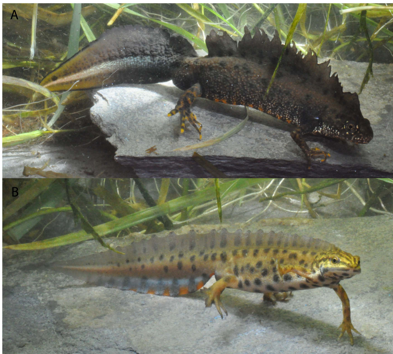
Figure 1. The crested newt ( Triturus cristatus ) (A) and the smooth newt ( Lissotriton vulgaris ) (B). Both pictures show males from a pond in Pays de Herve (Belgium) and are representative of a rare and emblematic (A) and a more common and less protected (B) species. doi:10.1371/journal.pone.0062727.g001

much rarer than the smooth newt. This pattern is typical of Western Europe, where modernization of agricultural practices and urbanization of natural lands has resulted in a decline of pond-breeding amphibians [26,27]. Therefore, this situation may be representative of very large areas of Europe in the near future. Two previous studies fit this pattern, but have suggested that new surveys targeting sympatric crested and smooth newts, including a larger set of variables, are needed to identify processes acting at various scales [22,23]. Specifically, a number of previous studies considered landscapes within a radius of 400–500 m from ponds, whereas finer-grain studies suggest that more detailed, shorter-range analyses may also be valuable [28]. Among the wide range of pollutants that are toxic to amphibians, laboratory studies have evidenced the risk of water pollution by nitrogenous compounds as found in fertilizers and urban water discharges [29], but until now no field studies have assessed their detrimental effect on newt distribution. This could be particularly relevant in periurban and agricultural areas dominated by cattle grazing. Past landscapes (i.e.